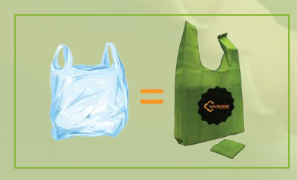
Feels similar to conventional plastics